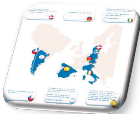
The "Comoestas Project" across the world.