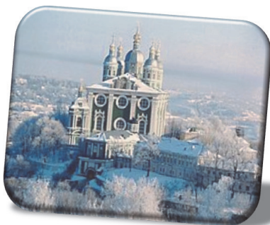
“Smolensk: 18th century Assumption Cathedral”.

European Headache Federation is incorporated in England and Wales as a company limited by guarantee; registered charity no. 1084181